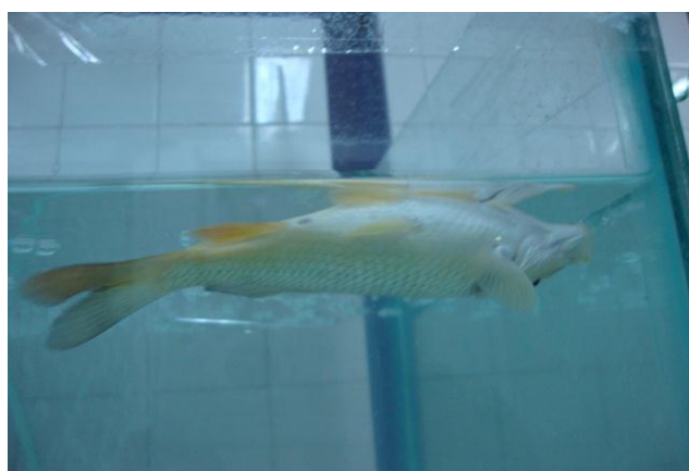
Fig.3: Show imbalance in posture and loss of equilibrium of fish