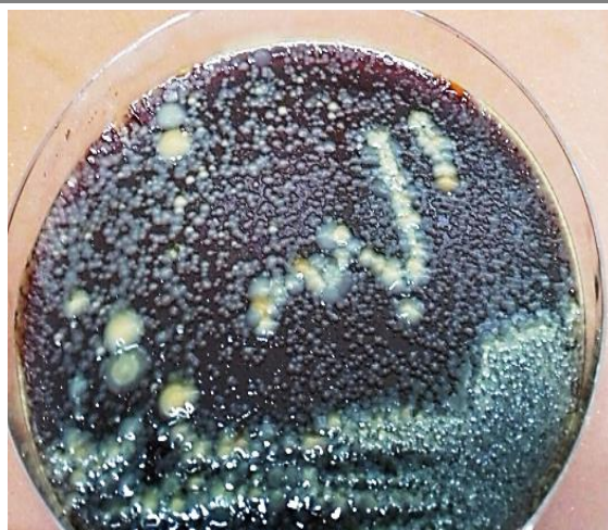
Figure 1. Heavy growth of A. hydrophila on modified ampicillin sheep blood agars