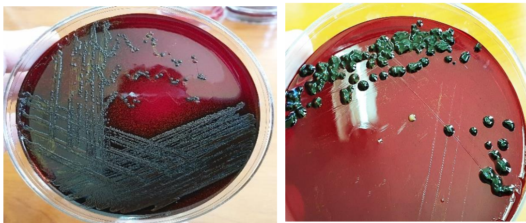
Figure 2. Biofilm feature of A. hydrophila on modified Congo red agar