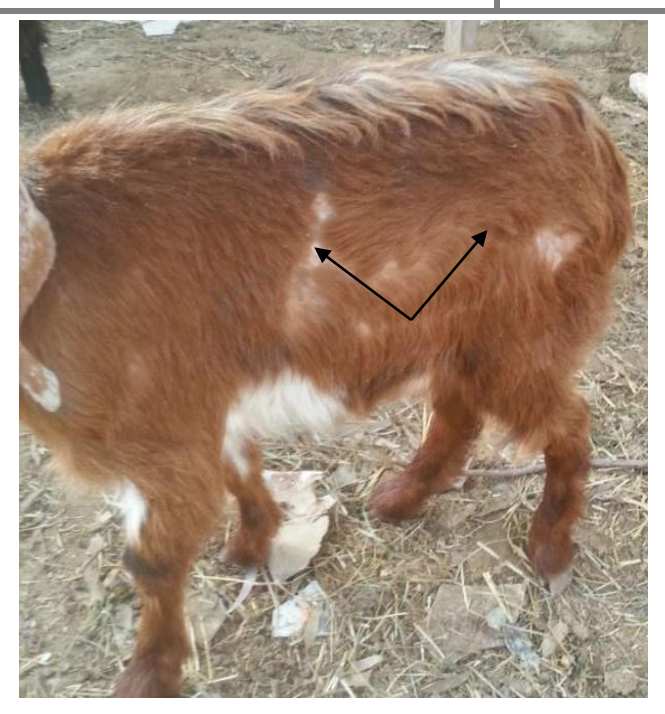
Figure 2. Goat on the 10<sup>th</sup> week (end of the study) with rough and hair loss and emaciation

The pale mucous membrane, itching, loss of appetite, and emaciation (Figures 1-4).