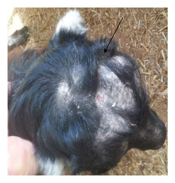
Figure 1. Goat on the 10<sup>th</sup> week (end of the study) with rough and hair loss in head