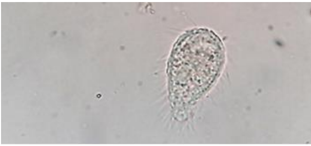
Figure,1: Trophozoite of B. sulcata in sheep drinking water in direct wet film (100x).