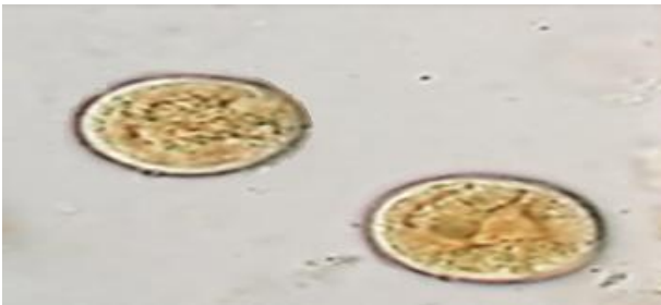
Figure, 3: Cyst of B. sulcata in sheep fecal sample in direct wet film (100x).