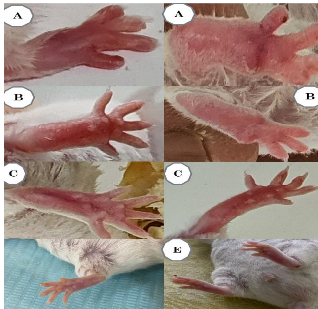
Figure 3. Anti-inflammatory effect of L. camara at paw oedema induced by egg albumin in mice after one hour. A: Positive control, B: treated with 0.01%, C: treated with 0.03%, D: treated with 0.05%

Values are means±SEM, n= 5. Means with the different capital letters in same column and small letters in same row differed significantly, ( P\leq 0.05 )