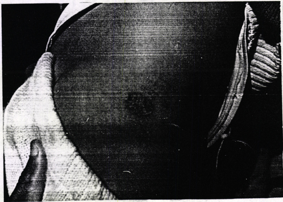
Fig. 3. Lesions of cutaneous leishmaniasis before and after treatment with HSCS 7% . A- Before treatment. B- After treatment.