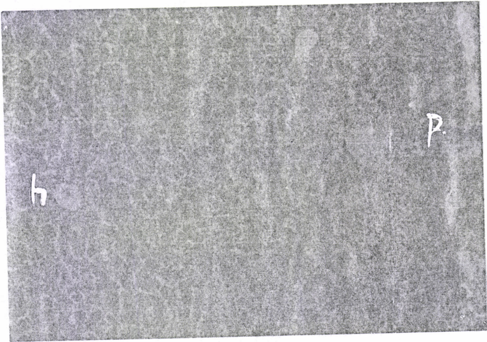
Figure1: Liver section of control birds with normal hepatic histology. h = terminal hepatic venule, p = portal tract. Hematoxylin and eosin stained (100x).