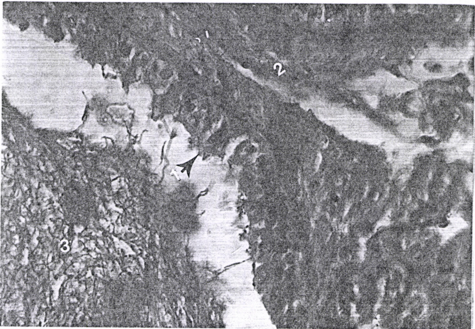
Fig. 1: Section of ductus epididymidis showing 1- ciliated epithelium surrounded by 2- masses of connective tissue, 3- the lumen of ductule charged by spermatozoa. Hematoxylin eosin-phloxin X500.

epididymal region of the domestic fowl showed no differences in the stain ability of these two columnar cell types.