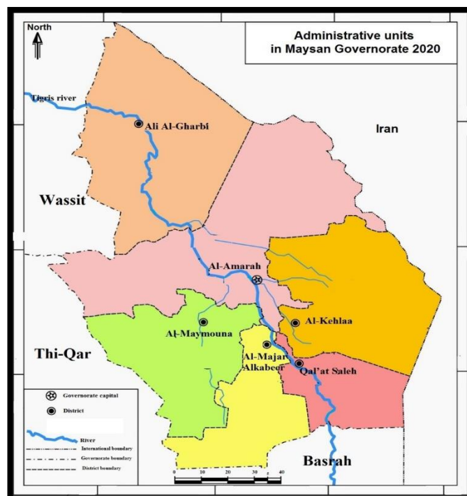
Figure 1. Map of the study regions

The samples were collected from six regions in Misan province, Iraq (Figure 1), including: Ali Al-Gharbi, Al-Amarah, Al-Kehlaa, Al-Maymouna, Al-Majar Alka beer, and Qal'at Saleh for a period extended from December 2019 to November 2020.