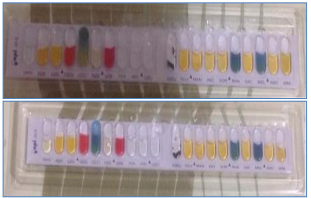
Figure, 2: Biochemical characters of Y. enterocolitica by API20E system.